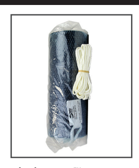
Block Worx™ BCT Time Release Bacteria Block