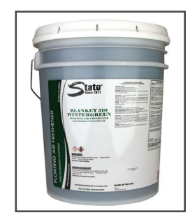
Blanket 510 Wintergreen™ Floating Air Freshener