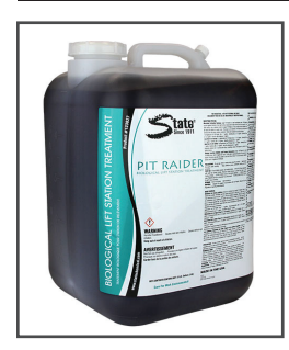
Pit Raider™ Hydrogen Sulfide and Sludge Treatment