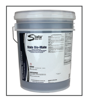
Bio-Mate™ Biological Catalyst