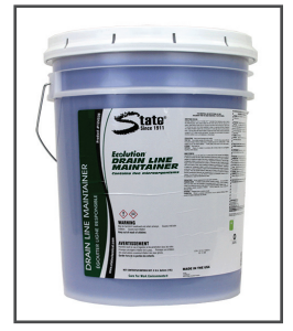
Line Bac'R™ Bacterial Drain Maintainer