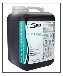
Pit Raider™ Hydrogen Sulfide and Sludge Treatment