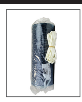
Block Worx™ BCT Time Release Bacteria Block