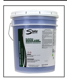
Ecolution® Drain Line Maintainer Grease Trap and Lift Station Maintainer